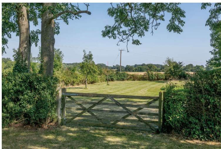
View of our garden and paddock beyond to show our eastern boundary along which the second proposed haul road would run.