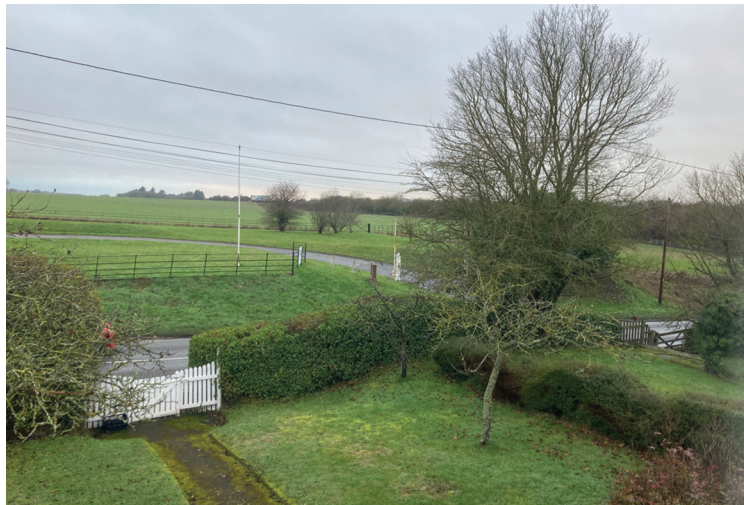
View from bedroom window to show that we overlook the proposed laydown area, materials storage area, haul road, borrow pits and J24 slip road.