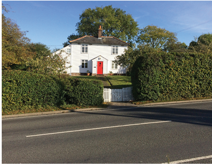
View from the B1023 showing our house and front boundary hedge.